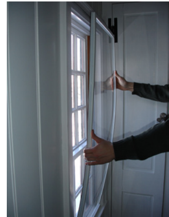
Interior storm panel.

Several retrofit measures perform as well as new replacement windows. Specifically, interior window panels, exterior storm windows and cellular blinds essentially match the energy savings of new, efficient replacement windows. (See energy savings comparison chart on Page 3.)